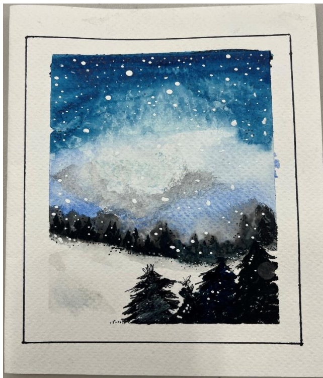
Thank you from M'WIKWEDONG Indigenous Friendship Centre