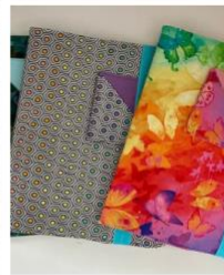
Note Book Cover (Moleskin Cover) CAS10.00

Robin has a vast body of quilting work since 1999 and a trunk show lasting at least 45 minutes + along with a story of her "Significant Quilts" Sure to inspire! In the spring, Robin will be teaching an in person workshop on Ruler Quilting on your Domestic Machine.