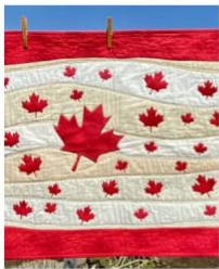
Canadiana Quilt Pattern CAS12.00