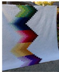
Modern Ombre Quilt Pattern CAS12.00