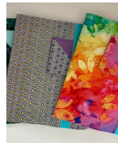
Note Book Cover (Moleskin Cover) CAS10.00