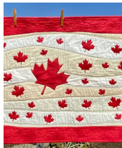
Canadiana Quilt Pattern CAS12.00

Date: November 2, 2023 at 2pm and 7pm (in person at ICAC)