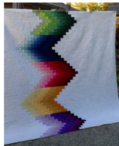
Modern Ombre Quilt Pattern CAS12.00